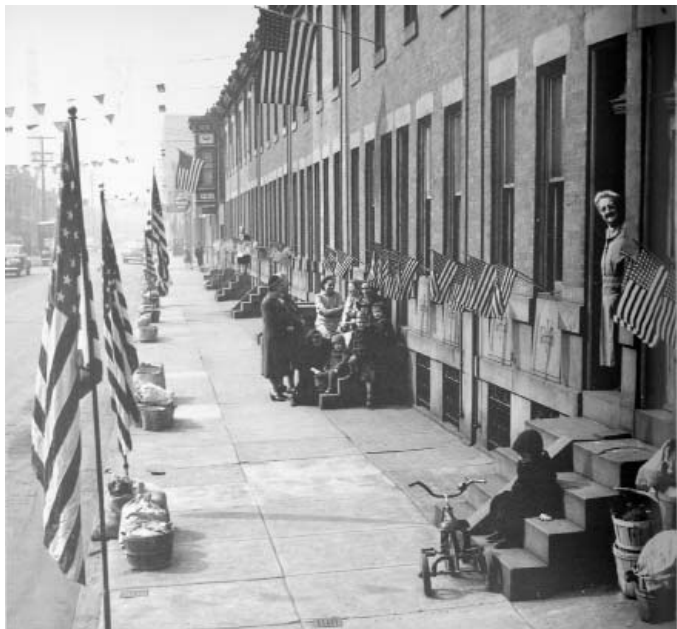
Philadelphia prepares to greet CSJO conference

For the day timers, who do not need lodging—Full conference— $175.00